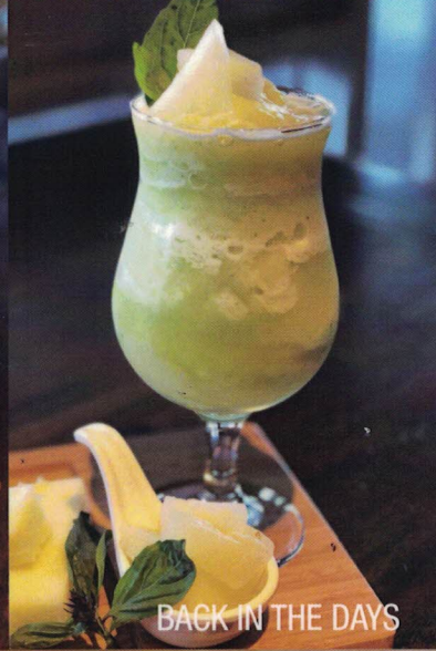
BACK IN THE DAYS