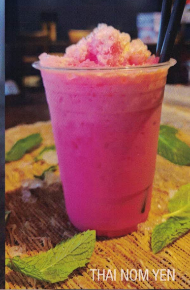
THAI NOM YEN